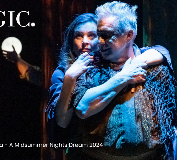
Oberon & Titania - A Midsummer Nights Dream 2024

For over 30 years, The Shakespeare Company has been Calgary's premiere classical theatre company. Each year we produce a season of plays anchored by the works of William Shakespeare, juxtaposed with other classics and more contemporary works inspired by them.